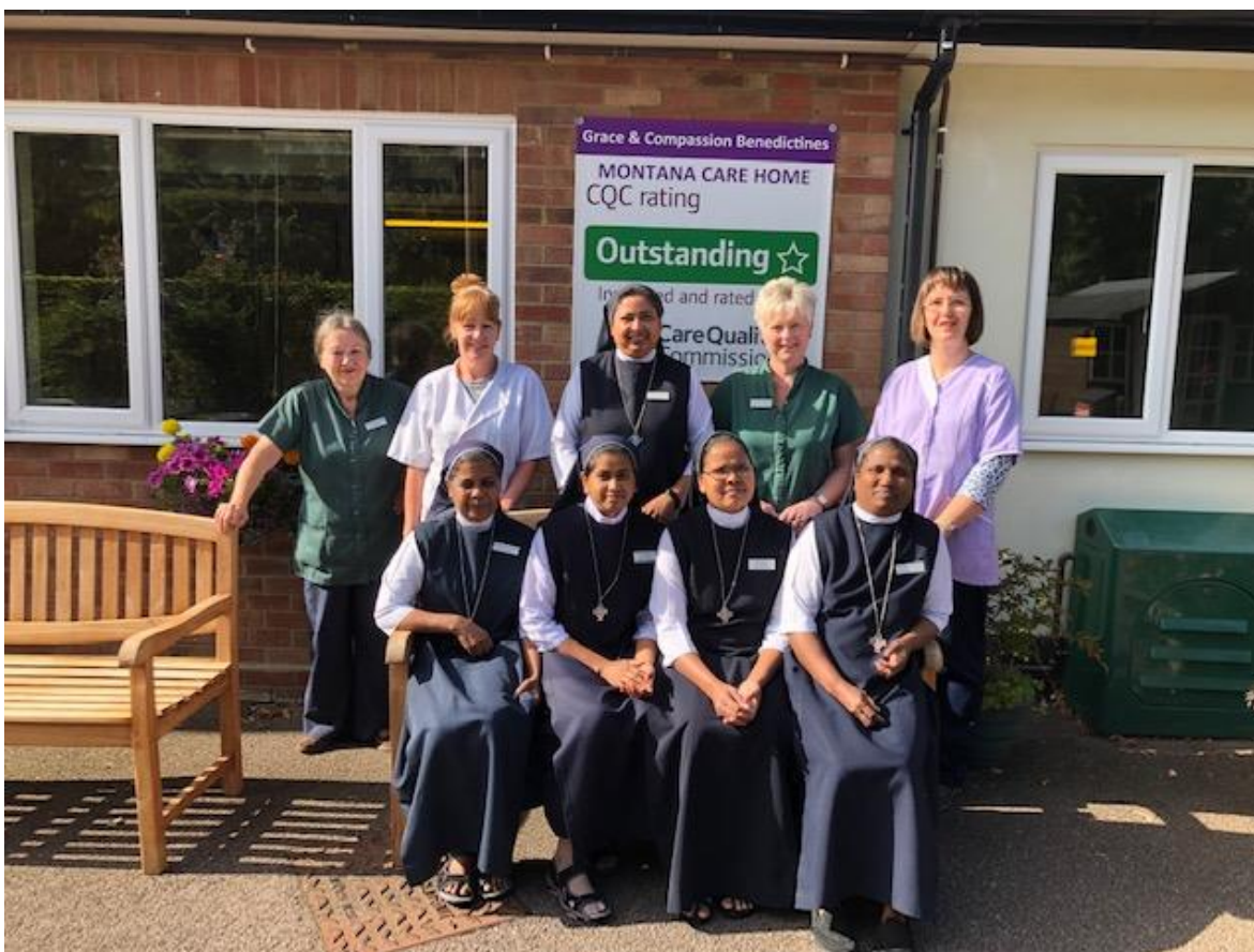
Top 20 Recommended Care Homes East of England 2019 - Montana Care Home